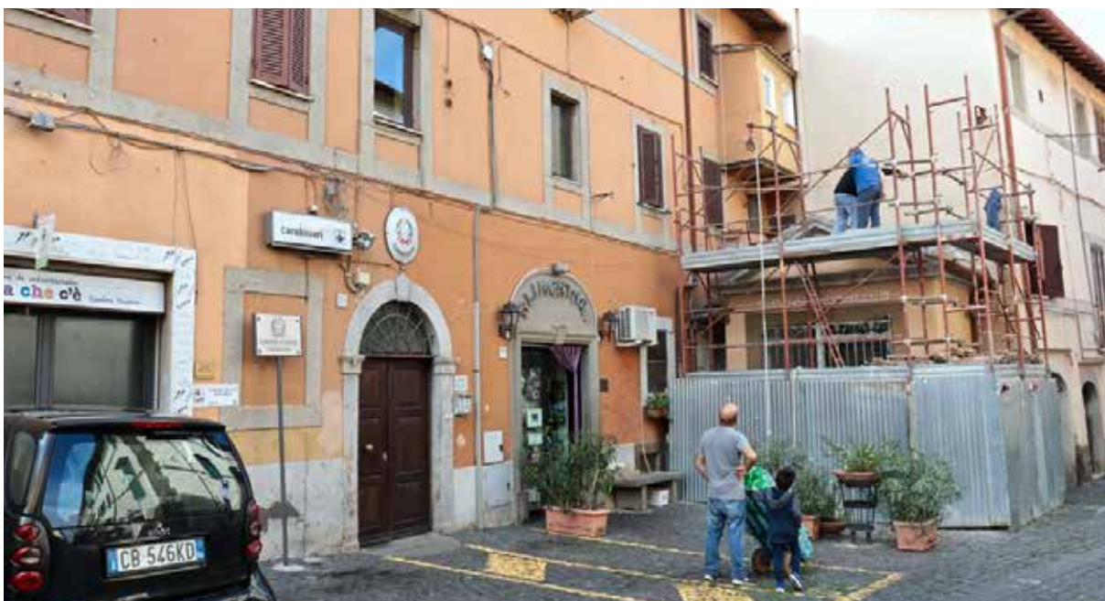
The main entrance to the former College Villa at Monte Porzio, part of which is now an Alimentari and a Carabinieri station. To the right is the shrine in ristauo , described in more detail above.