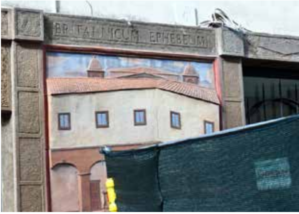
Another interesting Monte Porzio building. Ephebeum means a gym used by young people, a school or a college. The connection with the VEC, if any, is at present unknown.