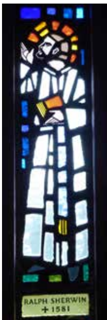
Stained glass window in Corpus Christi church, Headington

In 1658, three years after his death and with Charles II on the throne, Cromwell's corpse was exhumed and he was strung up as a regicide.