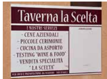
A trattoria at the rear part of the former College Villa

How to find the former College Villa: From the Belvedere piazza of Monte Porzio it's a 5 minute walk through the gated archway into the old town. At the via Cavour turn left and the Carabinieri Comando Stazione is straight in front of you on via Giuseppe Verdi.